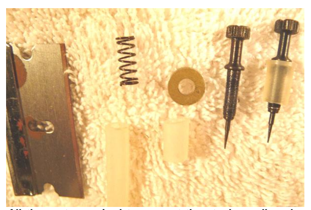
All the parts required to convert the stock needle valve assembly.

Solutions: Use one of the larger 8cc stunt tanks for the greatest range. These are commonly found on Golden Bee, Super Bee, Black Widow and Venom engines. Since the stock needle valve w/ spring arrangement is prone to leaking, modify the needle valve assembly as follows. Remove needle valve, discard the spring, install a #4 flat washer, and then add a piece of medium silicone fuel tubing. Inspect the tip of your needle valve to make sure it's not bent. Re-install the needle valve and you now have one cheap, but air tight needle valve assembly.