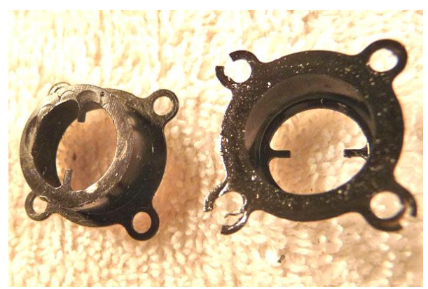
(L) excessive wear on top of reed retainer (R) cracked flange holes on reed retainer

7. The same holds true if your crankcase ever makes a squeaking noise on start up, or shutdown. When this happens, I replace the whole crankcase assembly, because the crankpin has worn (tapered) causing the rod to slide off the crankpin and rub away at the tank. Examine your tank regularly. If you notice excessive rubbing, (see photos) you'll need to replace your crankcase assembly or crankshaft at minimum. If you are able, use the newer type tank that incorporates the nylon reed retainer. A steel crankpin rubbing on nylon is much preferable to one rubbing on aluminum. Again, watch for excessive rubbing on the nylon reed retainer and replace the offending worn parts as necessary.