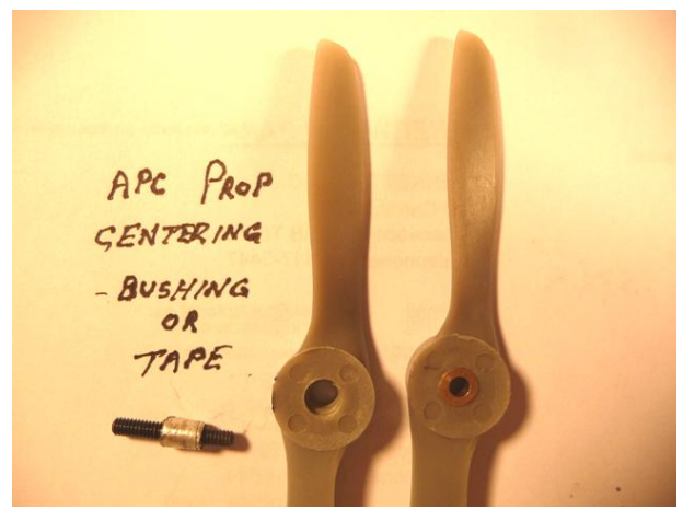
Centering APC props w/ a big prop hole: Use of a bushing, aluminium tape or thin fuel tubing can all be used here.

Solutions: 1. Use the right length tank screws with silicone sealant on top. 2. Check tighten the glow plug, prop spinner, and mounting bolts before every race. 3. If field disassembly can't be avoided, use Loc-Quik super primer T accelerator, with blue Loctite thread locker upon re-assembly. The tank back can be sealed on the field using a single piece of sticky Fascal tape over the entire backplate with only the venturi area cut away.