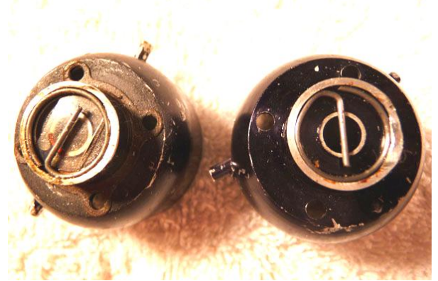
Black Widow tanks: note severe wear around reed retaining 'G-clip' area and reed seal venturi hole area.

1. Always keep your engine clean and always protected from corrosion with a plastic bag or rag. Always filter your fuel, especially when changing containers. Ensure your fuel bulb is in good shape and not cracked or flaking rubber. Better yet, <u>replace it yearly</u> for a paltry $4.00 and don't worry about it. When everything checks out OK, and your engine still hic's and cough's, it's very possible that dirt in the fuel system somewhere (or bad fuel) is causing the problem. It doesn't take much dirt to raise havoc with a Cox reed engine which is why it's just so important to keep your motors <u>scrupulously clean.</u>