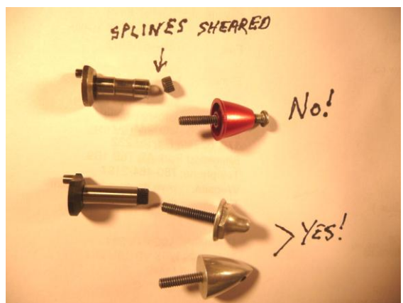
A 5-40 TPI prop stud (screwed ALL the way in) & spinner is used to prevent the Killer Bee/Venom type crankshafts from shearing at the splines.

Using a modified crankcase with a bronze sleeve bearing in the crankcase is a gamble. Unless the clearance honing is perfect, it can be noticeably slower than stock. My experience has shown that Cox's hard anodizing makes for a very good bearing surface, and so the stock Killer Bee or Venom set up is more than adequate. It's a good idea to lay some 400 wet/dry sandpaper over a piece of glass, and with the addition of some oil sand the back of the crankcase. This will remove any burrs that might otherwise prevent a perfect seal with the fuel tank. It's also useful to use a 2-56 TPI bottoming tap on the crankcase holes as extra threads in that area help.