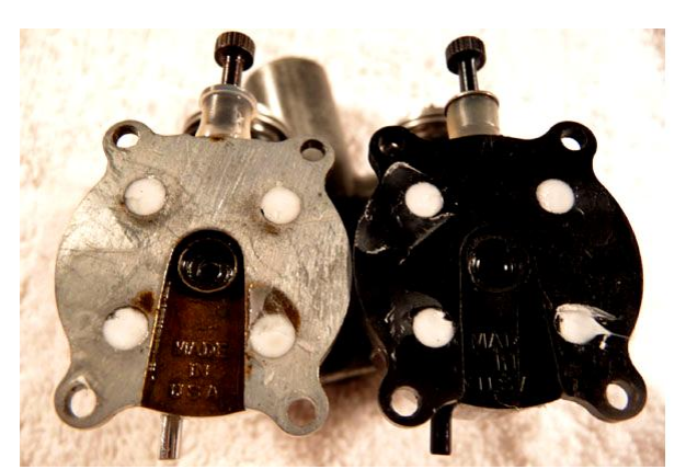
After final assembly, the tank screw hole areas are filled with RTV silicone sealant for leak prevention.

What about 'other' reed materials and shapes? Cox engine designer Larry Renger prefers the Cox stainless steel reed over the Mylar reed. My main concern with the steel reed is that it wears the anodizing right off the mouth of the venturi tube, although the rpm seems to be the same. I've tried other reeds made of thinner steel, floppy disc material, etc. and so far haven't found anything better. One Australian made metal reed was indeed 300 rpm faster, but it broke away after only a few minutes of running. Teflon reeds may or may not work as well. I've not found them to be any faster, and sometimes worse. The