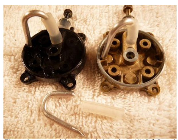
The replacement pick up tube is bent from 3/32" O.D. soft aluminium tubing & chamfered at the bottom to fix exactly. Silicone tubing attaches it to the tank back.

The fuel pickup absolutely <u>must</u> be located at the outboard corner of the tank. The normal neoprene tubing arrangement is prone to moving out of place and giving an unstable engine run. I bend a piece of 3/32" O.D. soft aluminum tubing and make the pick-up one solid piece. I file a chamfer at the bottom of the pick-up tube so that it fits perfectly into the back plate. Attach it to the tank back with a short piece of <u>tight fitting</u> silicone tubing. The net effect will be that the pick-up stays perfectly positioned. You will notice greater range and stable running from your engine, with a properly positioned fuel pick-up tube.