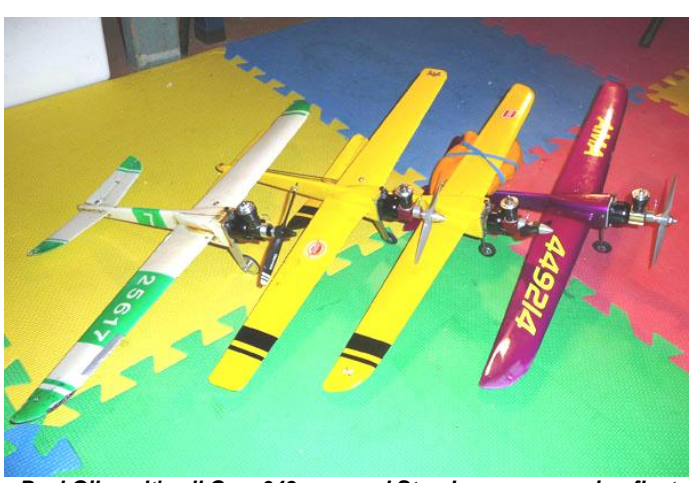
Paul Gibeault's all Cox .049 powered Streaker mouse racing fleet ready to race

You will notice this advantage in windy conditions (and when isn't it windy when flying Mouse!). Unlike many designs, the heavily tip weighted Streaker can darn near fly in a storm if need be. After all, anybody can fly in the calm....but successfully flying in wind separates the men from the boys!