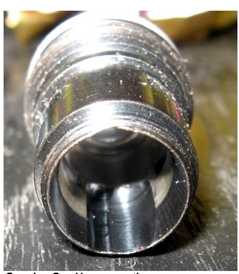
Genuine Cox Venom porting.