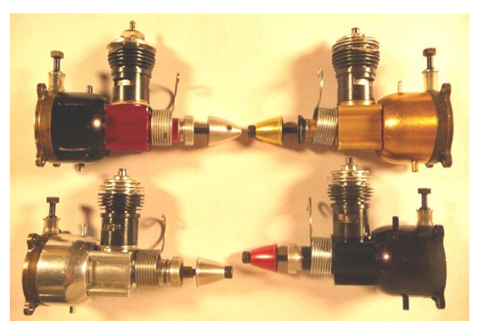
Cox .049 mouse racing engine variants: Top L-R: Venom w/ Galbreath head & Golden Bee. Bottom L-R: Silver Bee & Black Widow

I assume that if you followed my engine set-up tips, you should have a very decent running engine. The later Cox "Venom" engine can make you competitive quicker (due to the slightly better cylinder porting and better crank balance), but I strongly recommend one change. In the original production batch of engines, they varied from designer Larry Rengers' original drawing and made the piston too thin at the top. This caused the piston top to separate in as little as a half dozen runs. My cure has been to fit up a Tee Dee piston to the Venom liner (as described